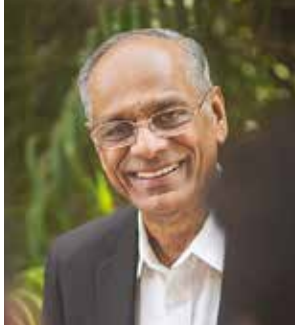
Message from Our Chairman

Few things have greater importance to parents than the education of their children. Every parent looks for academic excellence, good values, and discipline for their children. Choosing the right school for them is therefore a crucial decision.