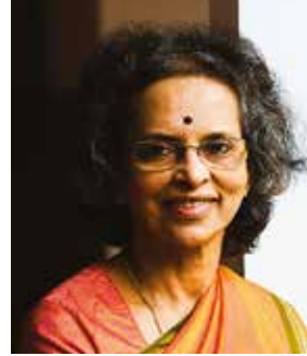
Message from Our Dean

Chairman - TISB, NAFL & NPS Institutions