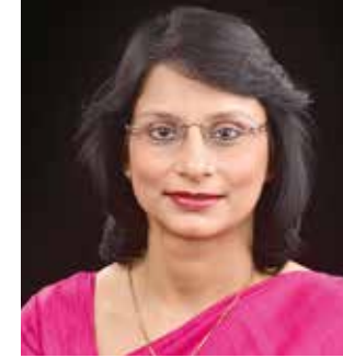
Message from Our Director

We envision a school environment to help students achieve their potential, offer guidance, hone their leadership skills and foster in students the confidence to explore a new range of interests, ultimately contributing positively to the societies they live in. It is our belief that every student in our school has the ability to succeed not just academically but as individuals in their own unique ways.